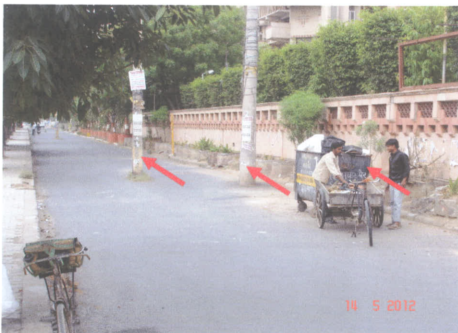
Electric poles and garbage bins in the middle of the roads!!!